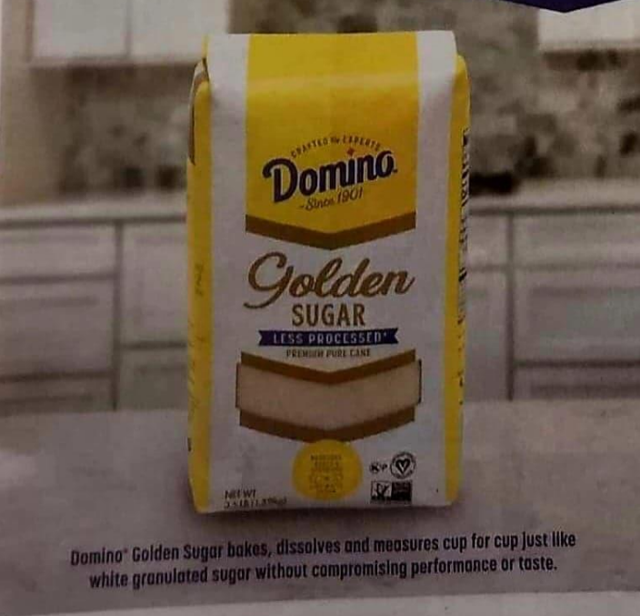
Domino® Golden Sugar bakes, dissolves and measures cup for cup just like white granulated sugar without compromising performance or taste.