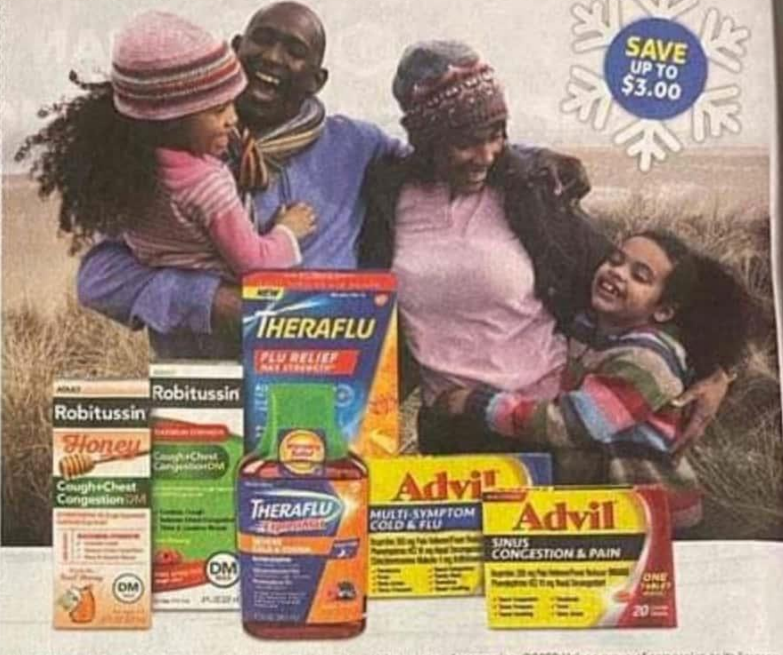
Use products as directed. Trademarks are owned by or licensed to the Haleson group of companies. ©2022 Haleson group of companies or its licensors.

Wegmans SAVE UP TO $2 00 with coupons in this insert