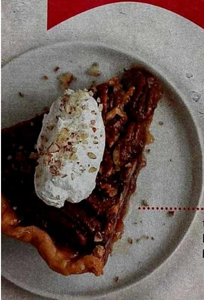
the gooiest Homemade Pecan Pie