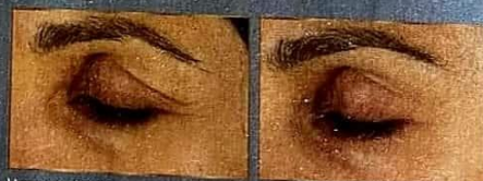
Unretouched images Before After 4 weeks