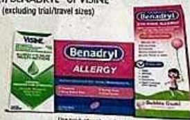
Use product only as directed.

Save $7 on any (1) BENADRYL® or VISINE® product (excluding trial/travel sizes)