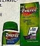
Use product only as directed.

Save $4 on any (1) Adult ZYRTEC® 24-60 ct. or Children's ZYRTEC® 24 ct. or 8 oz. product (excluding Wipes)