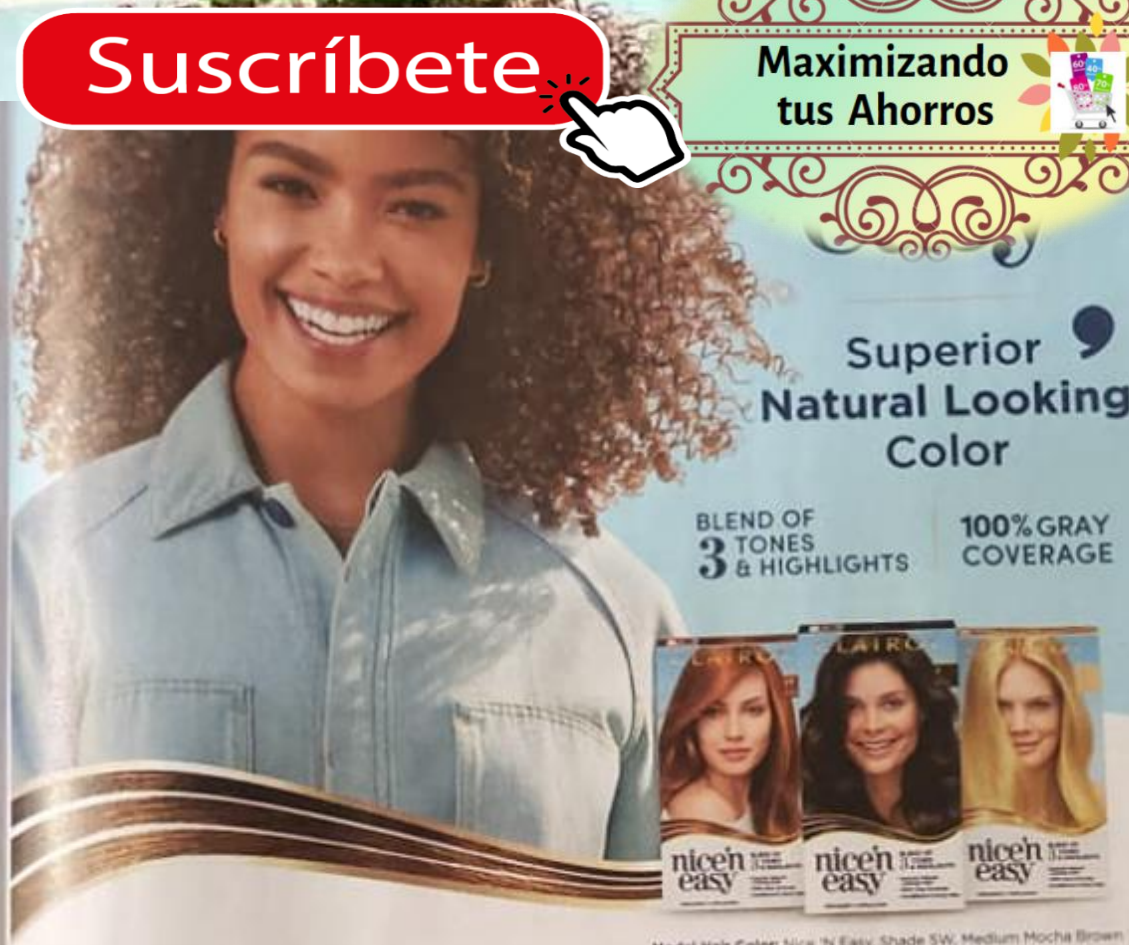
Model Hair Color: Nice 'N Easy, Shade SW, Medium Mocha Brown Also Available in 50 Shades