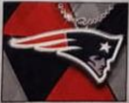
Team Logo-shaped Charm