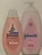
Use products only as directed.

on any (1) JOHNSON'S® Product (excluding wipes, trial & travel sizes and gift sets)