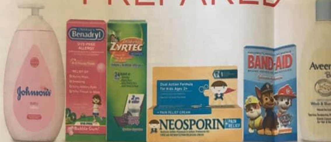
Use products only as directed. BAND-AID® is a registered trademark of Johnson & Johnson.